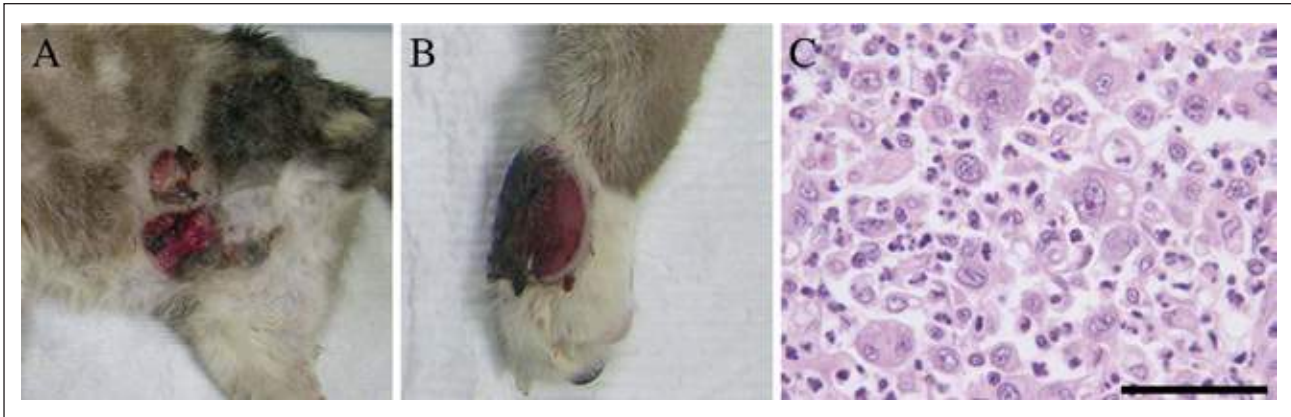
Figure 2 Gross and histological appearance of the skin lesions at recurrence. Gross appearance of the skin lesions at the previous site of amputation (A) and the toe of right hindlimb (B). (C) Pleomorphic histiocytes at the previous site of amputation. Haematoxylin and eosin stain; \times 1000 magnification. Bar = 50 \mu\text{m}